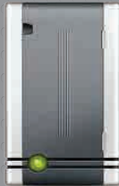
X Broker Back Office Server